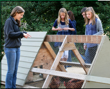
MMSK students cleaning the chicken tractor (mobile chicken coop).

Stream and Aquatic Life Study. The focus of this study will be to structurally improve the stream that bisects the school property.