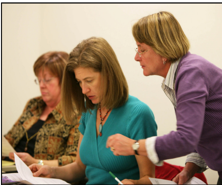
Stakeholders work on the KELP.

A Task Force appointed by Kentucky Department of Education Commissioner Terry Holliday is developing an Environmental Literacy Plan for Kentucky (KELP). In partnerships with KDE, the Kentucky Environmental Education Council and several other environmental education organizations are drafting the plan. The working group intends to present a draft of Kentucky's Environmental Literacy Plan to the full Task Force by early Summer, 2011.