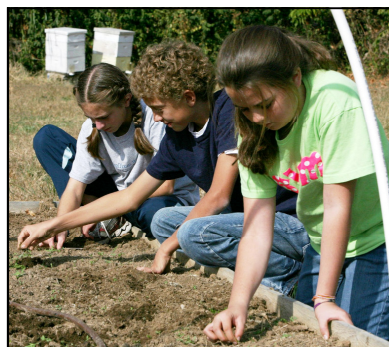
MMSK students planting cold weather crops in the school's raised beds.

Students at the Montessori Middle School of Kentucky have started off the 2010-2011 school year by studying sustainable living. In doing so, they have completed both the water and indoor air quality inventories this year, and have reviewed their previously completed energy, transportation and green spaces inventories.