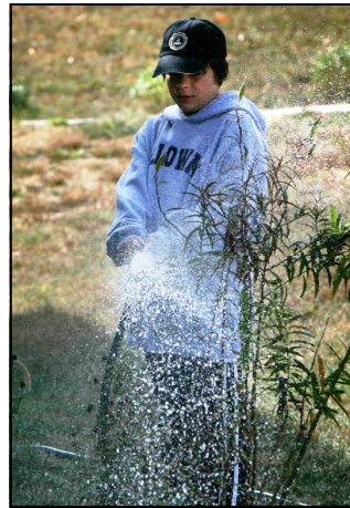
Student watering plants in the outdoor classroom.

In the green spaces category, the students have established a system of monitoring and providing