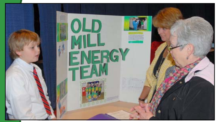
An Old Mill Elementary student presents work to KY Department of Energy Development and Independence staff.